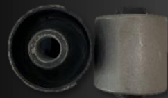
Trailing arm bushing for AT1228