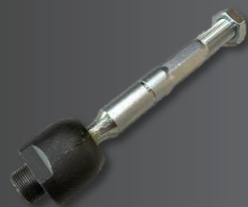
Rack end for both RH & LH