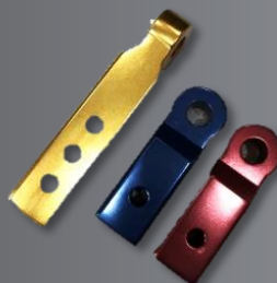
AX0537, AX0561, AX0562

Rated aluminum recovery hitch with multiple mounting locations, available in GOLD, BLACK and RED colors.