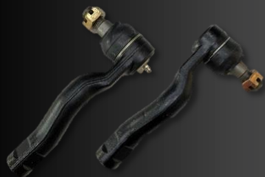
RH & LH outer tie rod end