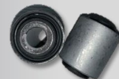
Adjustable panhard rod OE spec bushing for AT0961