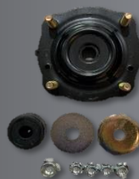
Rubber strut mount manufactured to OE spec with Zinc hardware.